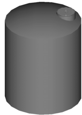
Typical RK – Series Tank